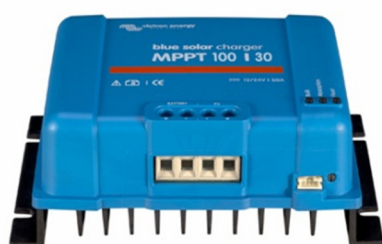
Solar charge controller MPPT 100/30