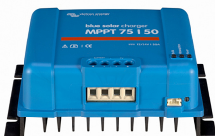
Solar charge controller MPPT 75/50