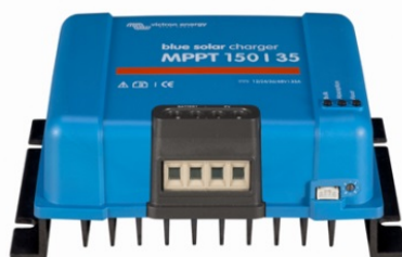
Solar charge controller MPPT 150/35