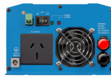
Phoenix Inverter 12/800 with AN/NZS 3112 socket