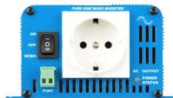
Phoenix Inverter 12/180 with Schuko socket