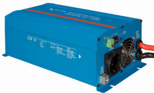
Phoenix Inverter 12/800 with Schuko socket

For our lower power models we recommend the use of our Filax Automatic Transfer Switch. The Filax features a very short switchover time (less than 20 milliseconds) so that computers and other electronic equipment will continue to operate without disruption.