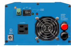
Phoenix Inverter 12/800 with Nema 5-15R socket