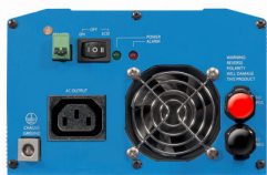
Phoenix Inverter 12/800 with IEC-320 socket