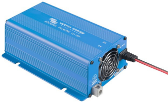
Phoenix Inverter 12/180