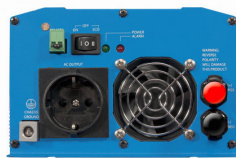
Phoenix Inverter 12/800 with Schuko socket