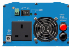
Phoenix Inverter 12/800 with BS 1363 socket